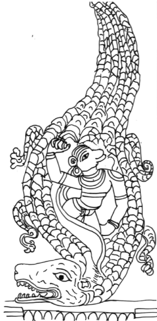
Fig. 9.4 Hanumān and Crocodile, Taramangalam