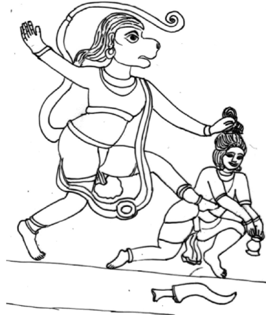
Fig. 9.3 Hanumān and Kālanēmi, Ahobilam

powers mentioned alike in the Telugu texts of Rāmāyaṇa besides Sameerakumāra Vijayamu and its illustration in the relief sculptures in the temples of Andhra Pradesh remind one of the parallel story in Rāmāyaṇa of the incident of Rāma killing the demon Mārīcha, the father of Kālanēmi who assumed the illusory form of a golden deer and reveals his true colours before his death. The present study thus indicates the transformation of the tale of Ramayana through expansion at narrative with the interpolation of the story of Hanumān killing Kālanēmi which might have been prevalent among the masses as a folk tale when it was rendered into vernacular languages.