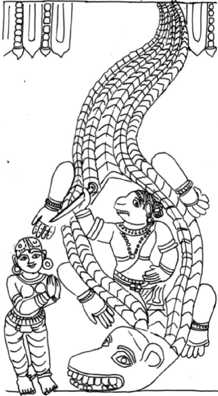
Fig. 9.5 Hanuman and Dhānyamālī, Srirangam