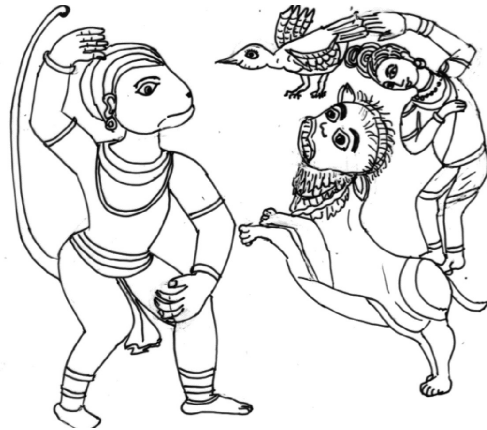
Fig. 9.7 Hanumān and Kālanēmi, Ontimetta