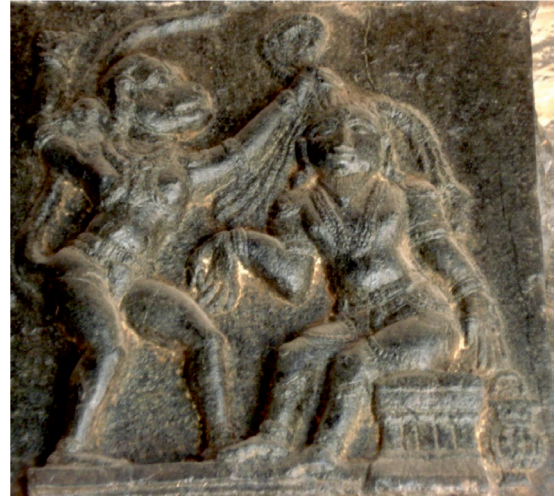
Pl. 5: Hanumān and Kālanēmi, Tadipatri