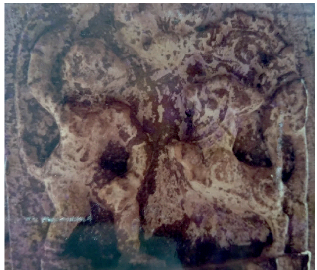
Pl. 7: Hanumān and Kālanēmi as Lion, Ontimetta