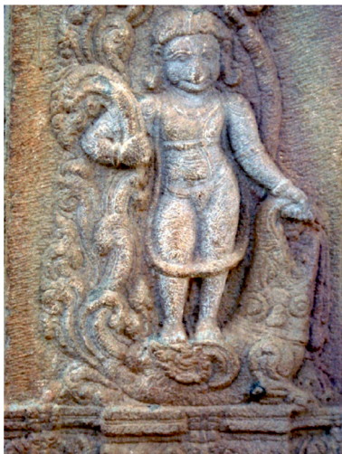
Pl. 3: Hanumān on Crocodile, Ahobilam