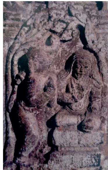
Pl. 6: Hanumān and Kālanēmi, Ontimetta