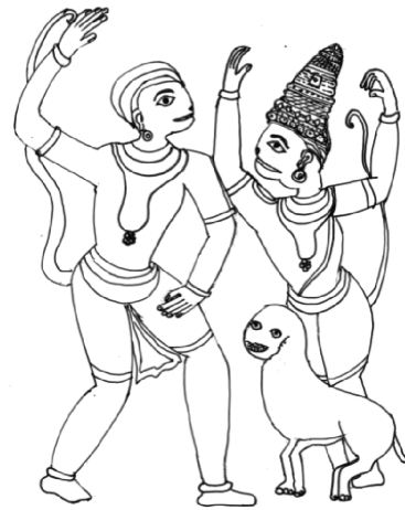
Fig. 9.8 Hanumān and Kālanēmi as Sugrīva, Ontimetta