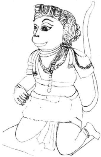
Fig. 9.1 Hanumān kneeling, Ahobilam temple