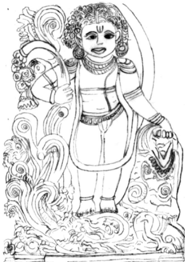
Fig. 9.2 Hanumān standing on crocodile, Ahobilam temple