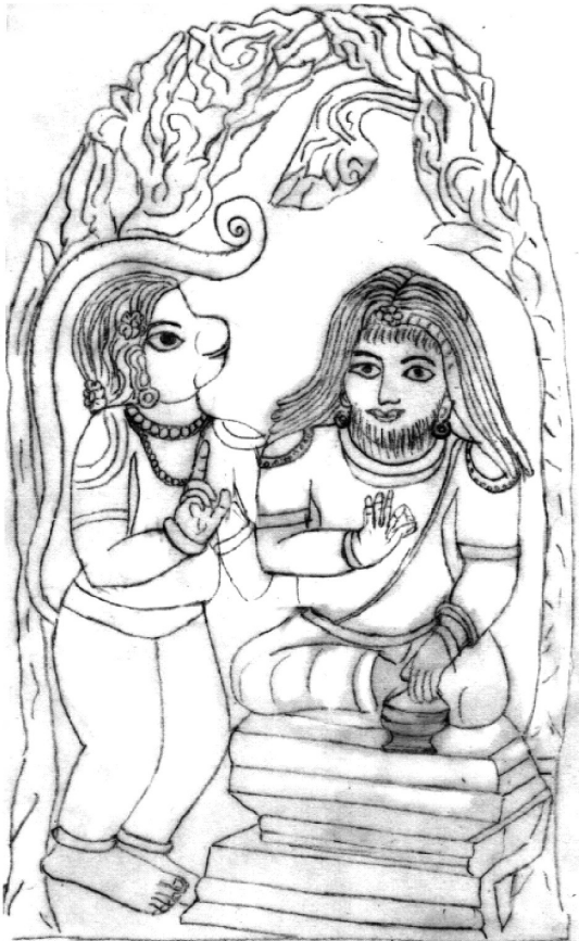
Fig. 9.6 Hanumān and Kālanēmi, Ontimetta