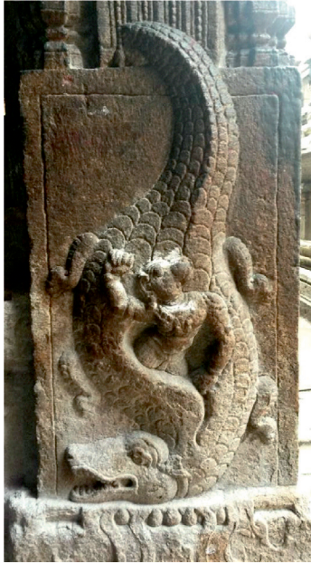
Pl. 2: Hanumān and Crocodile, Taramangalam