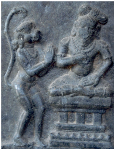
Pl. 4: Hanumān and Kālanēmi, Tadipatri