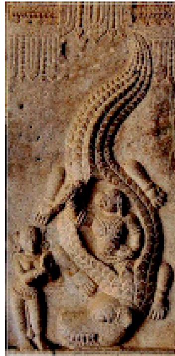
Pl. 1: Hanumān and Kālanēmi, Srirangam